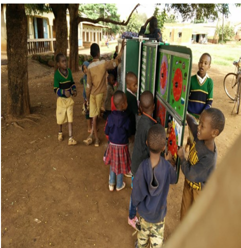
Figure 3: Kids in one of the Street attending Mobile School Sessions