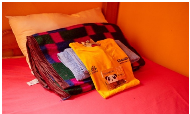
Figure 6: Girls Hostel Bedrooms

In June 2019, the building was inaugurated. The building can host a maximum of 24 kids at par, 4 at one room and each one on her own bed with the help of one Matron and one Residential officer. We decided to start with 15 kids as we still need to gain new insights on how to work with girls but with time we shall