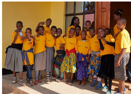
Figure 16: New Girls at their hostel with Matron and Social Worker