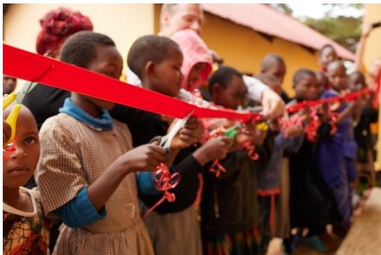
Figure 17: On Girls Hostel inauguration Day