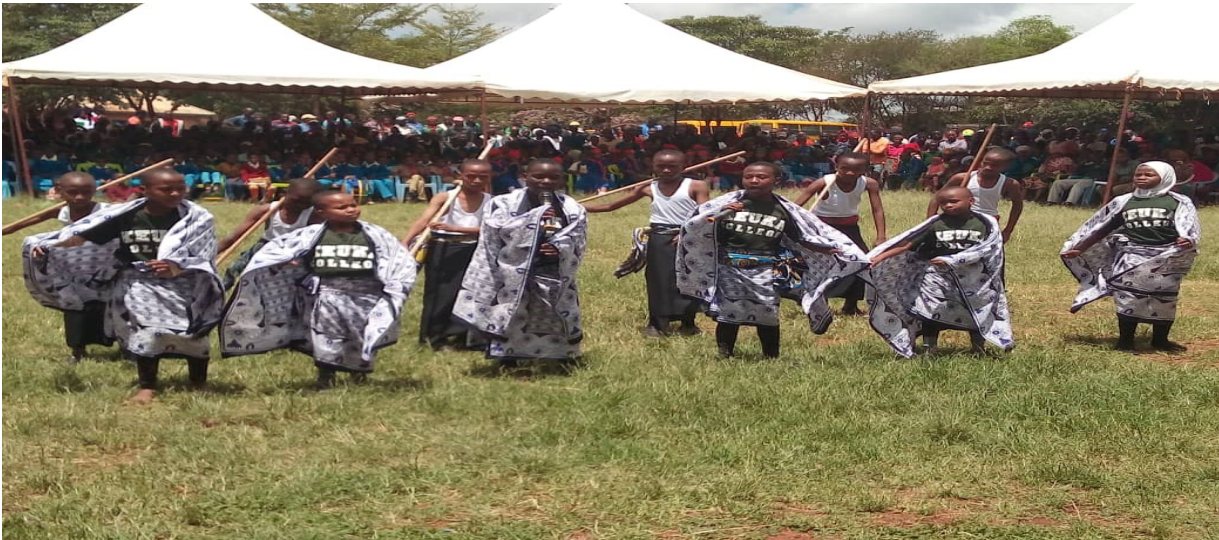
Figure 8: Kids participating in choir on African Child Day at Mazingira Bora

17 June 2019 at the District level. Good news was that, the guest of Honor (DC) had congratulated Mwema for good performance for both activities, Choir and acrobatic.