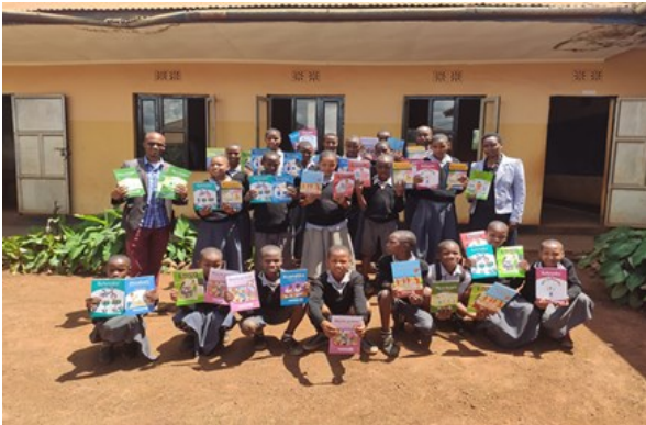
Figure 12: Teachers with Students Holding Books as a donation from Chameleon Tours who visited Mwema in October 2019