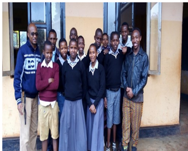
Picture 02: Some COBET Students who joined Endoro Primary School after successfully completion at MWEMA

Every year Mwema Children Center via Education unit, have a plan of meeting with heads Teachers of neighbor schools at least twice a year. However, due to changes in government regulations, this year 2019 we have only met with Endoro Primary School committee to discuss on how to facilitate the transfers of kids from Mwema Children Centre COBET School to join with Endoro Primary school so that they fit into public system. The current government regulation does not permit us to send children to far school but nearest one. This is always very important to our school because we have a time to share what we have and what other school have in terms of ideas and materials but as well as partnering in sports and games.