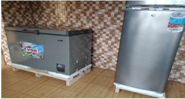
Figure 13: Fridge and Freezer in the kitchen