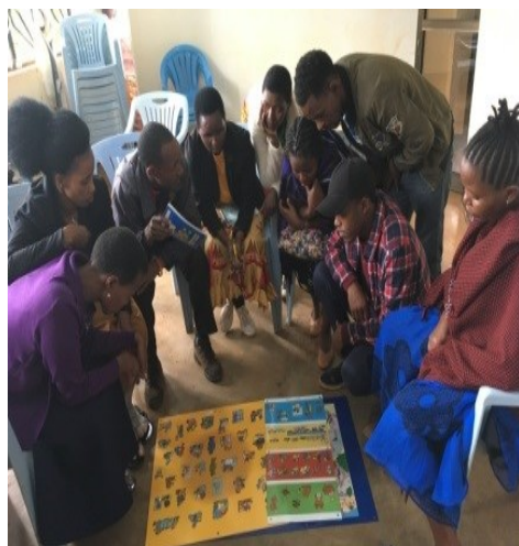
Figure 1: Team reviewing panel before going to the streets.

people including adults are getting chances to learn and understand different aspects of life, both educative and non-educative but funny ones. With 153 Mobile School's panel, it is easy for Mwema team to provide the needed service to Children in Karatu Streets with confidence that what is taught has been taught in its aggregates. It is easy to reach the aim of improving children self-esteem, as it is one of the mobile school themes. In the year 2019, through social department, Mwema has conducted 54 Mobile school visits/outreach in different streets within Karatu and reached 2503 audiences, of which 1003 being girls and 1499 being male. Most of lessons taught included; Self-awareness, Cleaning, Mathematics (numbers reading and counting, etc.), English, Science, Nature, Drugs Abuse, Entrepreneurship, Games and Sports and many