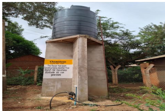
Figure 14: New Tower that facilitates Hot water in Girls Hostel