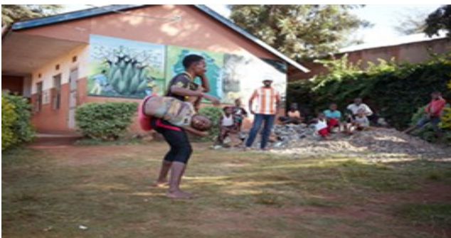
Figure 4: Street Talents Coordinator with his students exercising for Street Works during International Day for Street Children

Mwema Street Children center as is an NGO working with vulnerable children connected to street. In Karatu Street there are number of children with different needs and capabilities. There are kids who do not feel like going back to school even when they get support. Mwema Children through street talent program has a chance of nurturing their talents to help them at least cope with street life. This is not only for kids in the street but also those under Mwema support at the center. It is from these programs where Acrobatics, Music, handcrafts and many more talents have been developed.