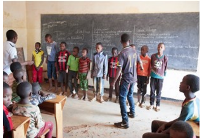
Figure 5: Kids at Mwema Day participating on Classes and Games.