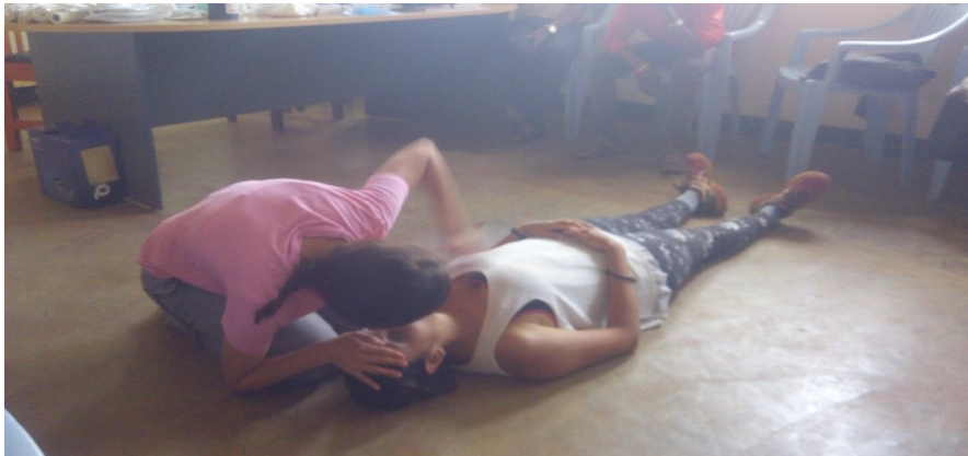
Figure 10: An experiment on helping someone during FIRST AID KIT Training