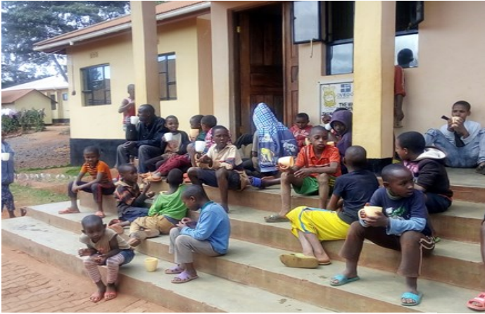
Figure 4: Kids at Mwema day drinking tea getting ready for morning sessions.

In 2018, at Mwema, we used to conduct Mwema day separately for boys and girls but in 2019 for better follow-ups, Mwema supported kids familiarization and building a spirit of sharing among kids, we decided to have a joint kind of Mwema day where both girls and boys participate. It showed improvement as it has been a time where all boys and girls worked as a Team. Different lessons were taught including, Cleaning, Entrepreneurship, Basic life and social skills, Drug abuse, etc.