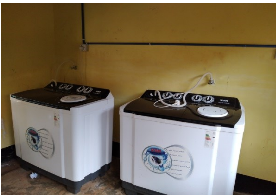
Figure 15: Washing Machines for Kids at the Center installed at Laundry Room