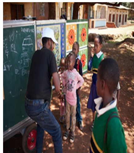
Figure 2: Mwema Staff teaching kids using Mobile School

other topics. Since 2018, we have been sending our reports to Belgium to StreertWIZE.org telling them how Mobile School is changing lives and we have been receiving positive feedbacks through the reports. The table below show the statistics of outreaches/visits in each trimester. One trimester equal to three months.