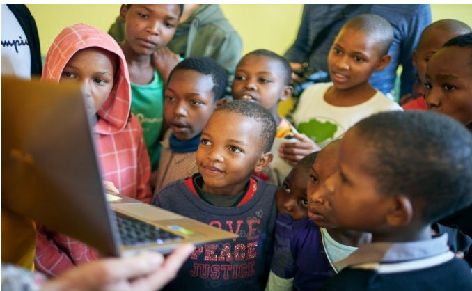
Figure 5: Girls in their Hostel staring at a picture on the laptop

Mwema Children center has been striving to protect and transforming lives of most vulnerable children for a better future mainly those in high risk of social exclusion. Since its founding Mwema had only a rehabilitation for boys almost for 12 years. All this time girls under our support had been staying with fit/foster parents or families missing out the chances of close supervision and psychological support. Nevertheless, in 2018, Chameleon Foundation from Germany one of our supporter, decided to build a modern house for girls, which is now a temporary home. Now both boys and girls are getting psychological support and all necessities of life, which somewhat they were missing while in the streets.