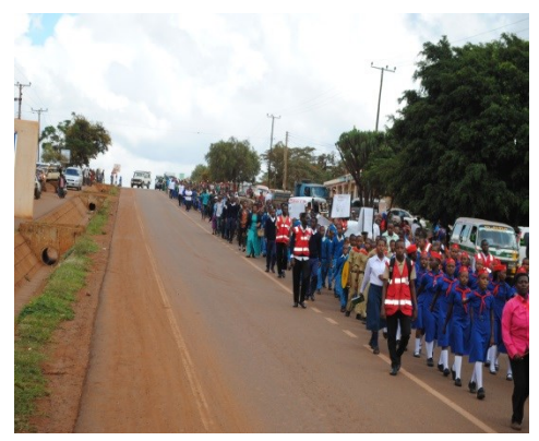
Figure 7: Mwema Acrobatics group showing their talents, seating and listening to other's performances and joined with other school in matching on the International Day for Street Children.